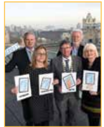
Euro Volunteering Capital Page 30