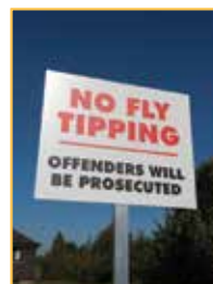
National Litter Survey Page 104

Despite a recent national litter survey showing improvements in cleanliness across Ireland over the past year, a new enforcement initiative involving local authorities, agencies and voluntary bodies now aims to tackle the growing problems of fly-tipping and illegal dumping.