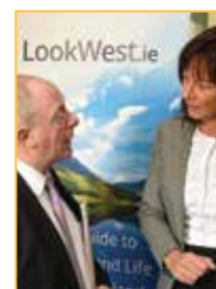
Western Development Commission Page 94

With a new board just appointed to the Western Development Commission, 'Council Review' takes a closer look at how the only regional development authority in the country has been helping to shape policy in the west of the country for close to 20 years.