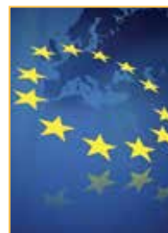
Regional Assembly Updates Page 81

Our new section reports on the latest news, EU funding projects, programmes and events from the Southern Regional Assembly (SRA), the Northern and Western Regional Assembly (NWRA) and the Eastern and Midland Regional Assembly (EMRA).