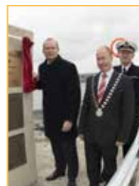
Haulbowline Island Page 96

The signing of a contract to transform the East Tip on Haulbowline Island into a state-of-the-art public park marks a significant milestone for Cork County Council in its role as Agent to the Minister for Agriculture, Food and the Marine for this remediation project.