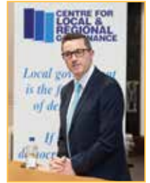
Dr Aodh Quinlivan Page 22

As uncertainty surrounds BREXIT for consumers and retailers alike, an all-island summit that aims to help resource our towns and villages to regenerate and work together to bring positive change to communities around Ireland will take place on 18 October in Sligo.