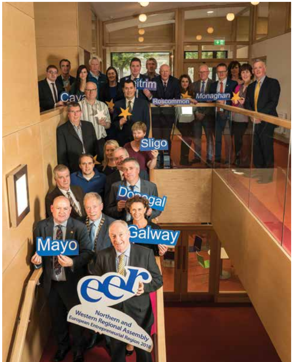
Regional Assembly members from Donegal, Mayo, Galway, Sligo, Roscommon, Leitrim, Cavan and Monaghan, pictured at the presentation of the award with Minister Michael Ring.

Adding the European Entrepreneurial Award is another example of how a region can collaborate effectively. Over the past year the Regional Assembly Members have developed a clear focus, emanating from the conference in late 2016 titled ‘One Region One Vision’.