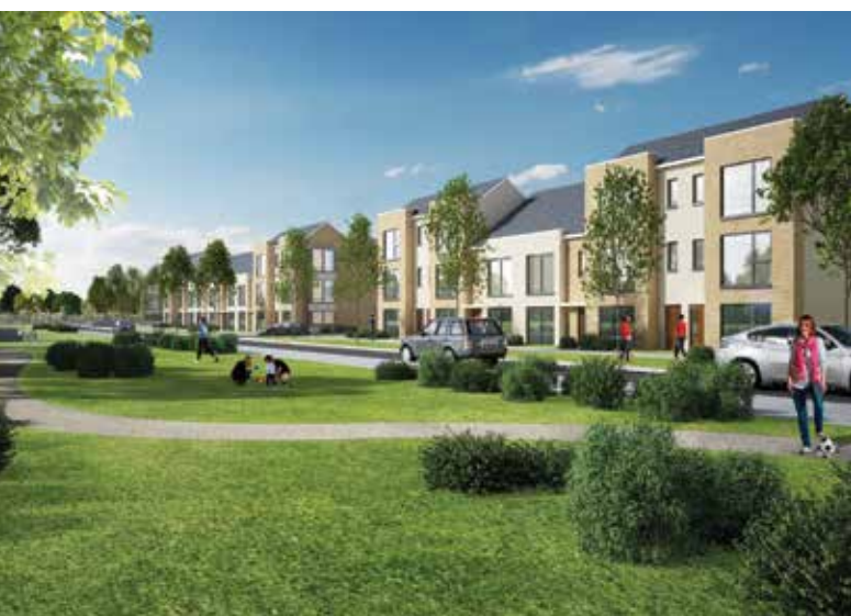
An artist's impression of the new Kilcarbery housing development in Clondalkin, Dublin 22.

As much of the master planning and pre-planning studies have been completed Adwood Ltd has committed to securing planning and being on site by early summer of 2019.