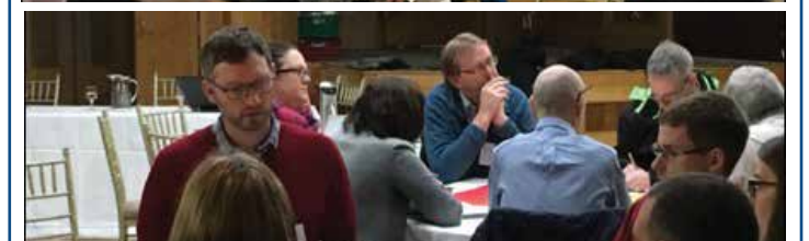
Training workshops for key staff in local authorities preparing the adaptation strategies have been held in three of the CARO regions (Atlantic Seaboard North, Atlantic Seaboard South and Eastern & Midlands regions), in collaboration with Climate Ireland. These have been followed up with the facilitation of on-site local workshops by the CARO teams, to assist local authorities in the development of their strategies.