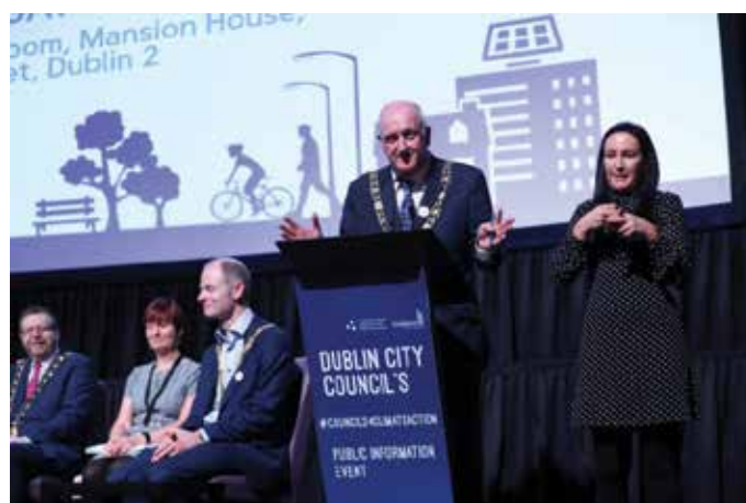
The Dublin CARO was officially launched by Cllr Nial Ring, Lord Mayor of Dublin in the Mansion House on Saturday 16 February 2019.