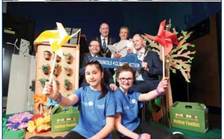
A series of public consultation engagement events took place in venues across Dublin's four local authorities from 13-28 February, while further public consultation on the four draft plans ran until 25 March.