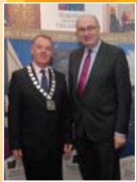
ACCC Conference Report Page 29