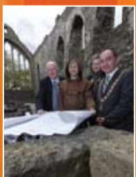
Kilkenny Urban Design Page 57