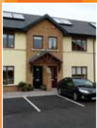
Social Housing Outlook Page 93