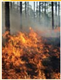
Wildfire Management Page 62

For public service personnel who wish to pursue further education programmes now is the time to check out the IPA's wide range of part-time certificate, diploma and degree programmes before classes start in September.