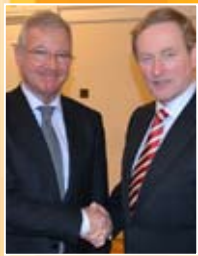
EU Unemployment Summit Page 80