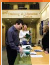
IPA Training Course Page 107