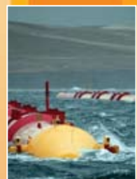
ESB WestWave Energy Page 75

Limerick City and County Council has commissioned some of the world's leading artists to inject colour into many of the Treaty City's derelict sites and buildings over the last few months. The council's project is just one innovative way it's supporting Limerick City of Culture by transforming open spaces.