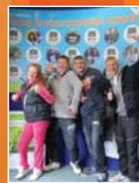
Young Environmentalist Page 51