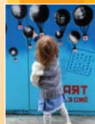
Limerick Transformation Page 65

Donegal County Council's 'Connecting the Wild Atlantic Way' Digital Marketing Conference gave delegates an insight into digital marketing activities and how the Wild Atlantic Way touring route can increase visitor numbers in Donegal.