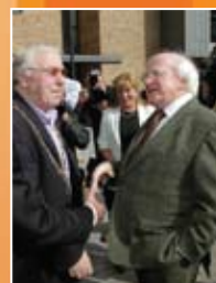
President Michael D. Higgins Page 81

Dublin City Council's new €16.9 million development Thornton Heights forms part of the regeneration of St Michael's Estate in Inchicore, and includes social housing and facilities management services provided by Circle Voluntary Housing Association.