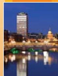
EU City Branding Page 43