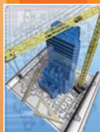
Meath's Blueprint for Growth Page 35