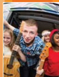
Music Generation Page 65