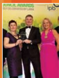
LAMA Awards 2015 Page 39