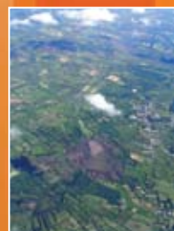
OSi Digital Mapping Page 81