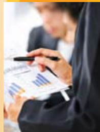
Action Plan for Jobs Page 25