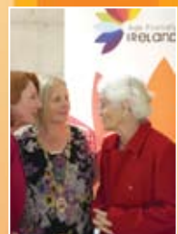
Age-Friendly Strategy Page 58