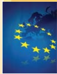
Committee of the Regions Page 23

In the current climate of tighter budgets and pressure on resources, many public sector organisations, including local authorities, are outsourcing services to external organisations under Service Level Agreements or Service Level Contracts.