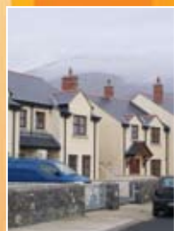
Social Housing Page 27