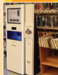
Open Library Project Page 53