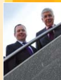
SEAI Better Energy Scheme Page 45

Stewart is currently constructing the new Roscommon County Council Civic Offices located on the site of the old fire station in the middle of Roscommon Town. The €13 million development is due for completion in the second quarter of this year.