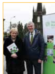
Rural Development Page 48

The Department for Arts, Heritage, Regional, Rural and Gaeltacht Affairs is to invest more than €28m in towns, villages and rural recreation projects this year. It will work closely with local authorities nationwide to roll out a number of community schemes under the Action Plan for Rural Development.