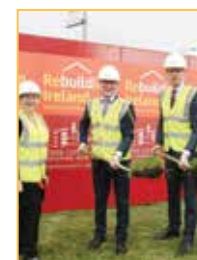
Cork City Council Social Housing Page 35

A comprehensive programme, which has seen Cork City Council fast-track solutions to social housing needs, is having the most significant impact on housing provision for over ten years. It will see over 400 new units under construction on 18 sites throughout the city by May.