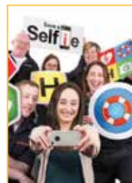
Emergency Networks Page 38

With an estimated 800,000 lifesaving devices in Ireland, including first aid kits, fire hydrants, extinguishers, AEDs and life rings, two local authorities (Dublin City Council and Wexford County Council) have so far supplied data to keep track of such devices in their own regions.