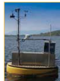
Dundalk IT Page 45

The German city of Essen has officially become the European Green Capital for 2017, following a ceremony in January in which the EU Commissioner for the Environment, Maritime Affairs and Fisheries, handed over the title from Slovenia's Ljubljana to Essen.