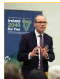
Minister Simon Coveney Page 15