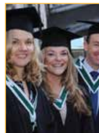
IPA Training Page 47

The Dundalk Institute of Technology's Centre for Freshwater and Environmental Studies (CFES) will spearhead a new €3.1m EU project to train 12 researchers to study the effects of storms and other climatic extremes on water quality in lakes and reservoirs.