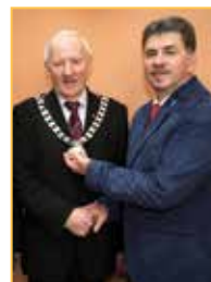
Southern Regional Assembly Page 105