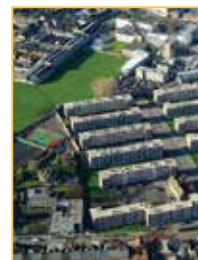
Dublin City Council Regeneration Page 22

Dublin City Council is making headway with the ambitious regeneration of its inner city housing complexes, with plans to complete and deliver some 4,200 quality homes in sustainable communities and create better urban places by 2022.