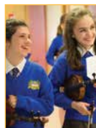
Music Generation, Wicklow Page 119

'Council Review' is also online at www.oceanpublishing.ie/council-review