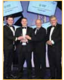
Offaly County Council Page 111

Public sector employees are five times more likely to experience violence than employees in other sectors, according to the findings of a new study, which reveal the scale of the issue for the first time in Ireland.