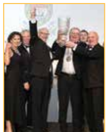
LAMA Awards Page 59