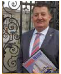
AILG President Page 33