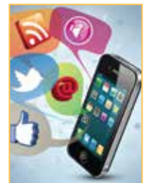
Communications Strategy Page 120