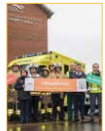
Road Safety Page 125