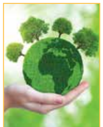
Green Procurement Page 40