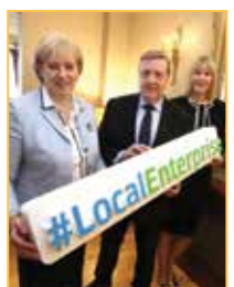
Local Authority Forum Page 71