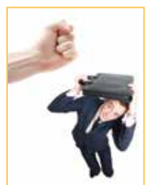
Health and Safety Page 158