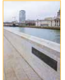
DCC Flood Protection Page 117