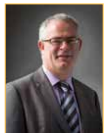
NOAC Report Page 133