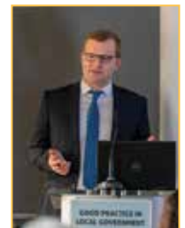
Good Practice Conference Page 127