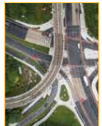
Dun Laoghaire Rathdown Page 143