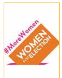
Women in Politics Page 45