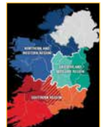
Regional Assembly Update Page 121