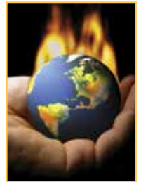
Climate Change Page 16