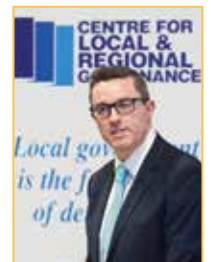
Boundary Extension Page 28