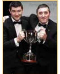
Wind Energy Awards Page 12

Longford County Council's Dedicated Regeneration Team is behind Innovation Hubs in Longford Town and Edgeworthstown, a Norman Village Tourism attraction in Granard, in addition to a range of streetscape and enhancement projects across the county.