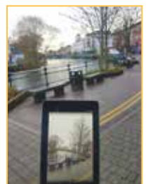
Sligo County Council Page 89