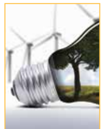
Wind Energy Page 134