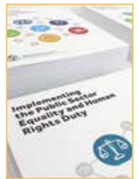
Public Sector Duty Page 29