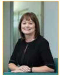
Fingal County Council Page 20

South Dublin County Council's River Poddle Flood Alleviation Scheme is due to come on stream in early to mid-2020, and forms part of the Council's Climate Change Action Plan with a focus on flood resilience, biodiversity and providing more accessibility to the river.