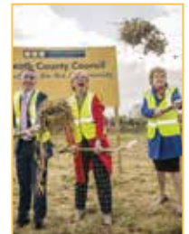
Meath County Council Page 117