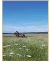
Sligo Tourism Page 99

A framework of strategic collaboration that will include key modules such as Research & Development, Talent Promotion plus Diversity and Inclusion forms part of a Memorandum of Understanding, recently signed between Technological University (TU) Dublin and ESB.