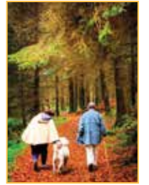
Longford County Council Page 109