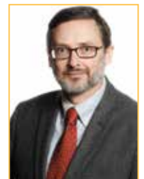
Mayoral Governance Page 32