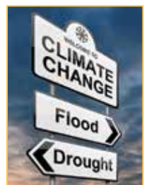
Climate Change Page 45