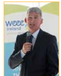
WEEE Ireland Page 126