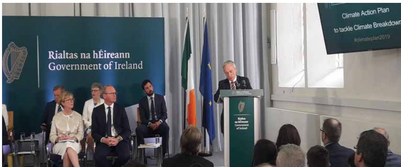
The Climate Action Plan 2019 was launched on 17 June by Minister for Communications, Climate Action and Environment Richard Bruton, who described it as “ambitious but realistic”.