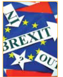
AILG Brexit Paper Page 107

A discussion document on Brexit, published by the Association of Irish Local Government, outlines the ways in which the local government sector in Ireland could respond to issues arising from Brexit, and highlights potential consequences to the sector.