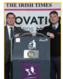
PEL Waste Reduction Page 89

Nine impactful and diverse Irish projects have reached the final of the European Innovation in Politics Awards 2019, for the second year running. Now all 80 finalists will find out if they have won any accolades at the gala ceremony taking place in Berlin on 4 December.