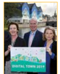
Sligo Digital Town Page 115

Selected as this year's Digital Town, Sligo was chosen for its achievements in cultivating a digital environment in the town, and for fully embracing the digital age for its residents and local businesses.