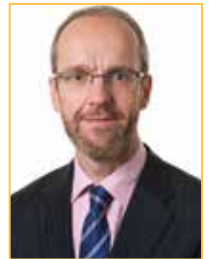
Planning Regulator Page 18