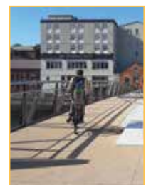
Cork City's New Bridge Page 120

Cork's newest River Lee crossing – the Mary Elmes pedestrian and cycling bridge – has been designed to enhance connectivity in the city by cutting daily journey times for about 11,000 pedestrians and cyclists, and promises to become a critical piece of public infrastructure.