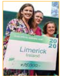
European Green Leaf Page 105

InterTradelreland and the Local Government Management Agency organised a Local Government Supplier Engagement event in October, in association with Dublin's four local authorities and those in Kildare, Meath, Louth and Wicklow. Based on the success of the event in CityWest Convention Centre, there are plans to roll it out in other regions across the country.