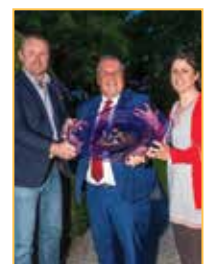
Kilkenny Energy Towns Page 93

With 22 local authorities shortlisted across 16 categories in this year's Chambers Ireland Excellence in Local Government Awards, which will be presented on 28 November, the addition of a new 'Age Friendly Initiative' category aims to showcase the efforts by local authorities in making Ireland a great place in which to grow old.