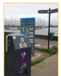
PEL Waste Reduction Page 114