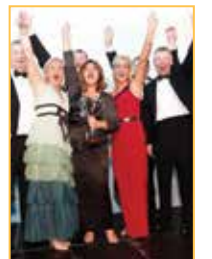
LAMA Awards 2020 Page 99