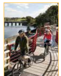
Greenway Developments Page 56