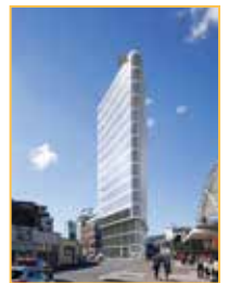
Cork City Developments Page 13