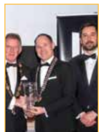
Irish Planning Awards Page 24