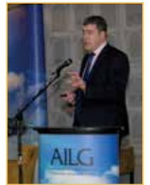
AILG Conference Page 92