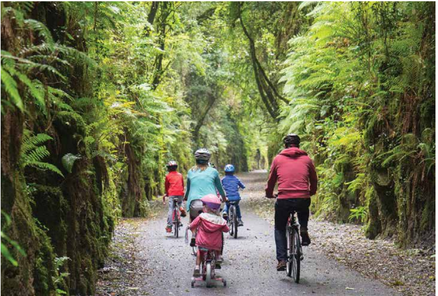
The 46km Waterford Greenway links Waterford City and Dungarvan along the old Waterford to Mallow railway line.

the Waterford Greenway from its opening in 2017 to November 2019, according to Fáilte Ireland. Two-thirds of those visitors – 68 per cent – said the Greenway was the main motivation for their visit to Waterford.