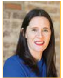
Human Rights & Equality Page 77

Local authorities can make use of a blueprint for an effective community response to the Covid-19 crisis under the Public Sector Equality and Human Rights Duty, according to Sinéad Gibney, Chief Commissioner of the Irish Human Rights and Equality Commission.