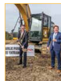
South Dublin's Adamstown SDZ Page 50