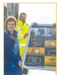
Meath Council App Page 31