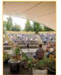
Kilkenny LEADER Partnership Page 80

Kilkenny LEADER Partnership (KLP) has made funding available for planning, training, capital and marketing to make rural communities smarter and more sustainable for the long-term. A recent 'Smart Villages' workshop heard that the initiative could be duplicated in other rural regions around Ireland.