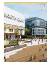
Waterford North Quays SDZ Page 42