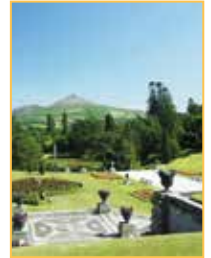
Wicklow County Council Page 72

Wicklow's County Development Plan for 2021-2027 has set out future projects across economic development, settlement strategy, tourism and retail strategy, climate change, green infrastructure, sustainable transport and town planning.