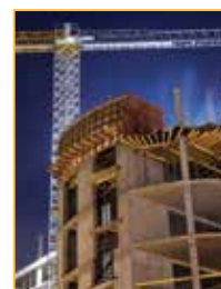
Construction Industry Page 17

With construction now underway on three new infrastructure projects at the Adamstown Strategic Development Zone in South Dublin, the €20m development is due for completion in 2022.