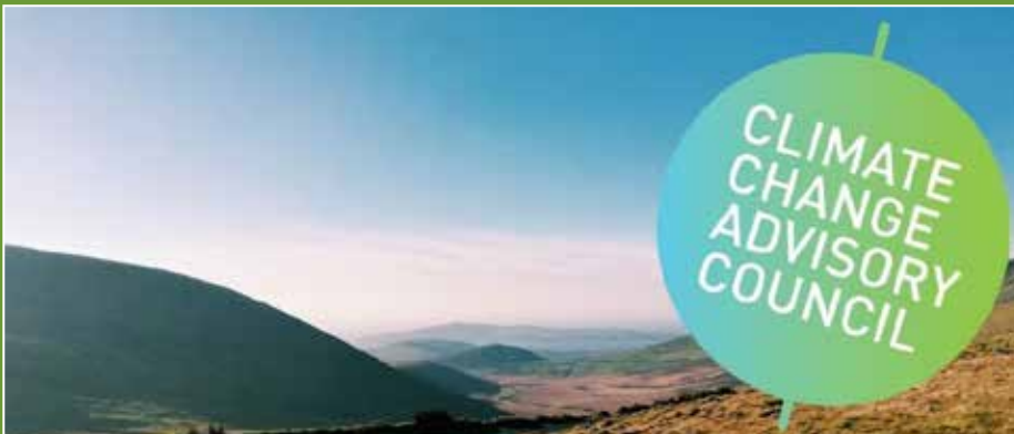
A key task of the CCAC is to conduct an annual review of progress made in reducing greenhouse gas emissions and furthering the transition to a low-carbon, climate-resilient and sustainable economy and society by 2050.

recognised as a key pillar to the Climate Action Plan and in this regard the plan envisages that existing initiatives and structures will be mobilised to maximise enterprise opportunities.