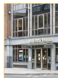
An Bord Pleanála Page 67