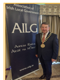
New AILG President Page 4

Clúid Housing's sustainability objective has influenced new developments, ensuring that they contribute to national climate goals, and motivates the agency's programme of retrofitting existing homes, to improve the carbon footprint.