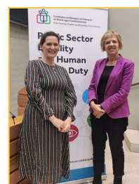
Human Rights & Equality Page 37