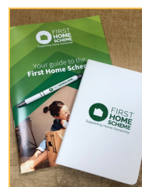
First Home Scheme Page 49