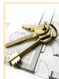
Key Housing Action Plans Page 41