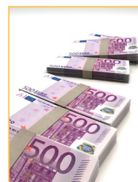
Budget 2023 Page 16