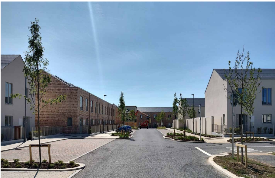
Dun Laoghaire-Rathdown's Ballyogan Square development in Carrickmines.