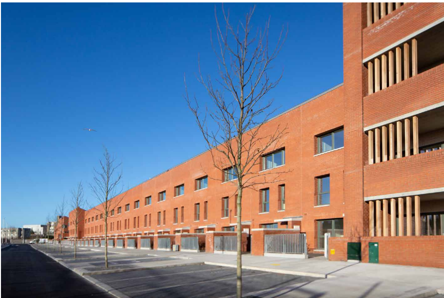
Dublin City Council's social housing development on Margaret Kennedy Road, Dublin 8.