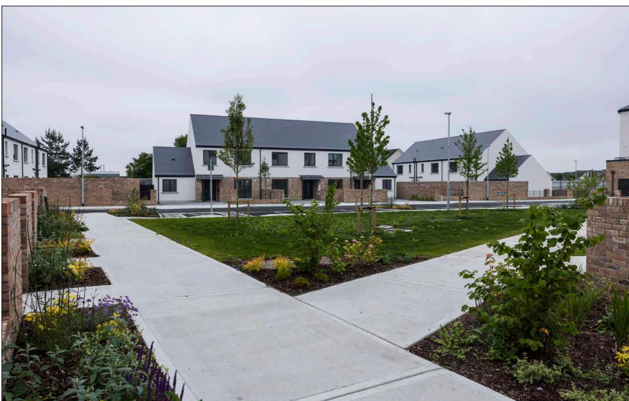
New social housing units were completed at Liscappagh in Finglas.