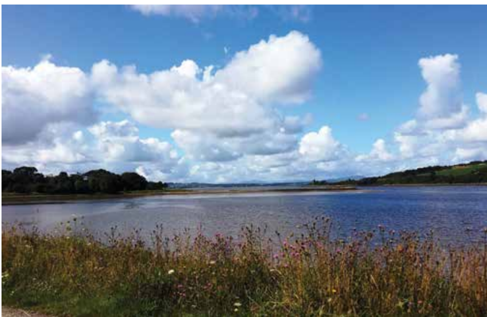
One of the scenic trails – Inch Levels Wildfowl Reserve, Inishowen, Co. Donegal