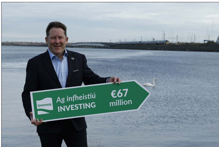
Transport Minister Darragh O'Brien pictured in Malahide, following his announcement of €67m in funding for Greenways for the year ahead.

Minister of State Seán Canney said that the continued expansion of our walking