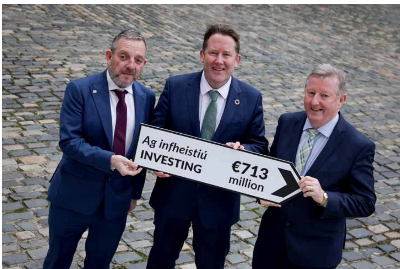
Minister for Transport Darragh O'Brien (centre) pictured with Ministers of State Jerry Buttimer (left) and Seán Canney (right) following their funding announcement.

The investment will allocate funds for over 330 road safety projects this year, an increase of 20% on last year.